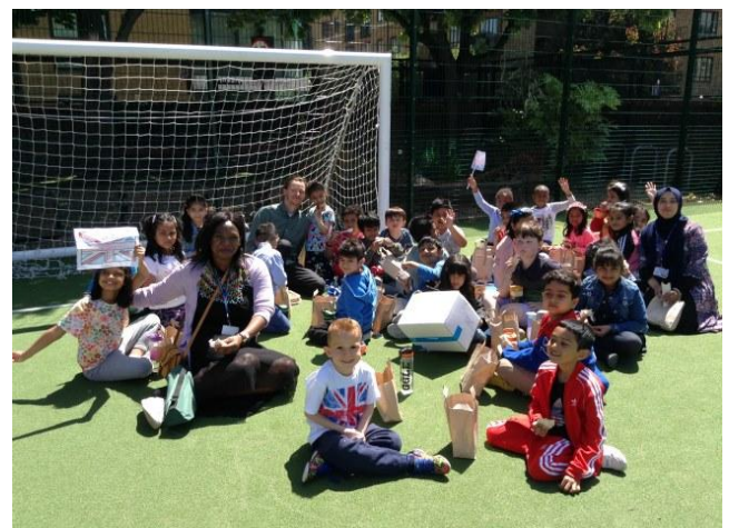
Sapphire Class at the school picnic on 27 May

Get involved in celebrating Her Majesty's historic reign in the run up to the Platinum Jubilee Central Weekend which takes place from 2 nd to the 5 th of June. Let us at The Chronicles know how you celebrated!