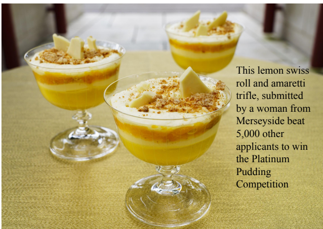
This lemon swiss roll and amaretti trifle, submitted by a woman from Merseyside beat 5,000 other applicants to win the Platinum Pudding Competition

There will be parades, light up beacons, a national pudding competition and other sports of other activities around the country and probably the commonwealth. 16,000 street parties are planned for the bank holiday weekend! Many people will be doing parades with the union Jack flag representing the country that she rules.