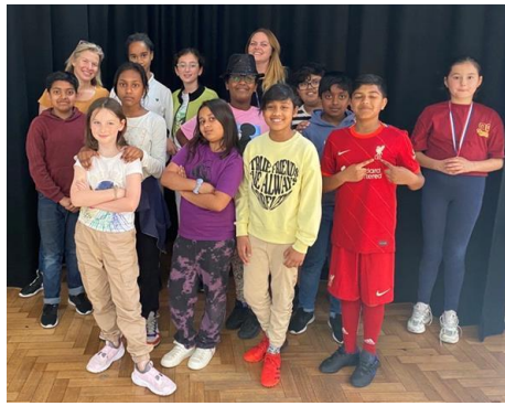
A very small reminder of the current Harbinger Chronicles Team