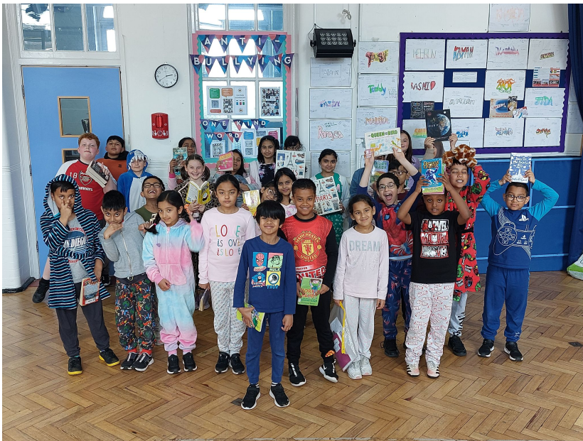
Year 5's Opal Class wear their pajamas and show off their reading

Welcome to the fourth edition of the Harbinger Primary School newspaper. Written by the children, for the school community; our newspaper is published every half term.